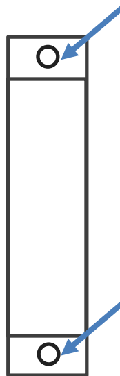
Figure 2-1 Mounting Bracket Screw Hole Locations (2)