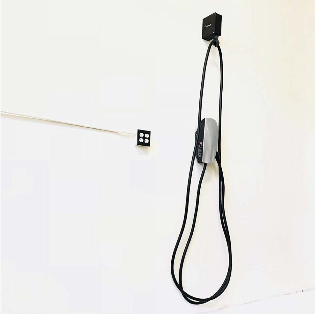
Figure 2-4 Example of installed product