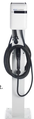
Single Port 4ft. Concealed Pedestal Shown