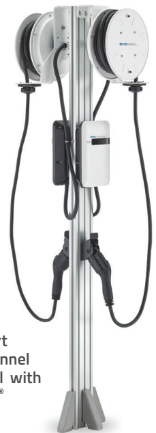
Dual Port 6 ft. Channel Pedestal with EvoReel® Shown