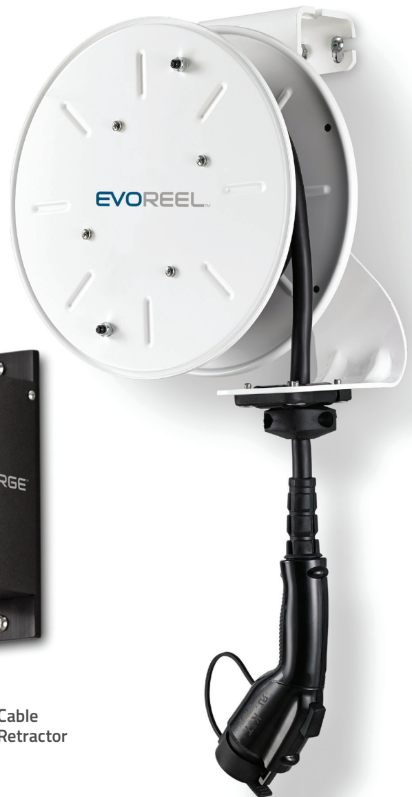
EvoReel® with Charge Cable